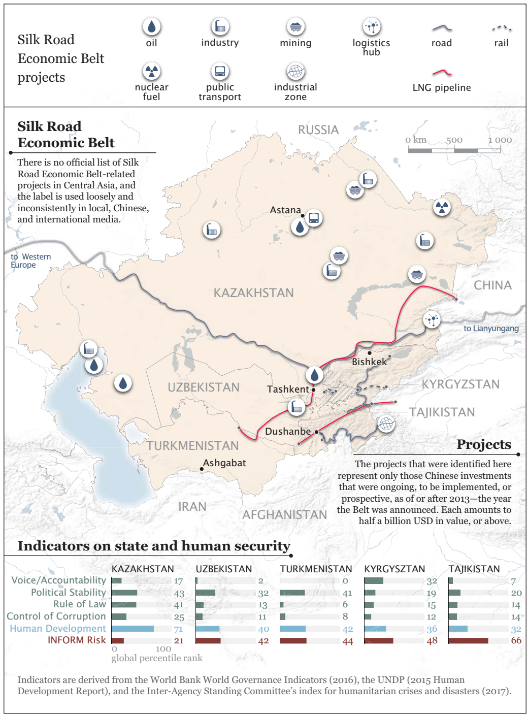
Figure 2.1. Map of Central Asia illustrating Silk Road Economic Belt projects and fragility indicators per state